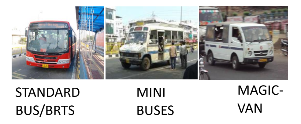
Figure 2. Types of Public Transport Modes in Bhopal

There are mainly three modes of public transport system available in Bhopal city (Figure 2) namely, standard bus services, known as Bus Rapid Transit System (BRTS), Mini-bus services and Magic-Van services. Bhopal BRT system (standard bus) was funded by the government of India under the Jawaharlal Nehru National Urban Renewal Mission scheme(JNNURM). Bhopal BRTS is operated by Bhopal City Link Limited (BCLL) and has an average capacity of 45 persons per bus. Most of the operational BRT systems in India primarily aim to connect sub-urban parts of the city. This low-floor bus service is available on sixteen routes only with 251 buses with an estimated ridership of about 160,000 passengers per day.