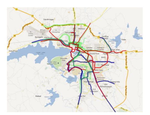
Figure 1: Road Network and Public Transport Coverage in Bhopal

There are mainly three modes of public transport system available in Bhopal city (Figure 2) namely, standard bus services, known as Bus Rapid Transit System (BRTS), Mini-bus services and Magic-Van services. Bhopal BRT system (standard bus) was funded by the government of India under the Jawaharlal Nehru National Urban Renewal Mission scheme(JNNURM). Bhopal BRTS is operated by Bhopal City Link Limited (BCLL) and has an average capacity of 45 persons per bus. Most of the operational BRT systems in India primarily aim to connect sub-urban parts of the city. This low-floor bus service is available on sixteen routes only with 251 buses with an estimated ridership of about 160,000 passengers per day.